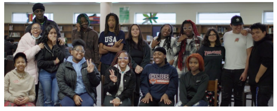
Envision Me Students, 2023.